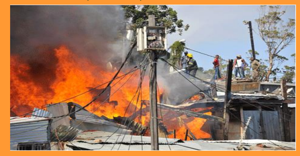
Tips on how to prevent shack fires

*XXXX – is a 4 digit unique number for the particular approved brand