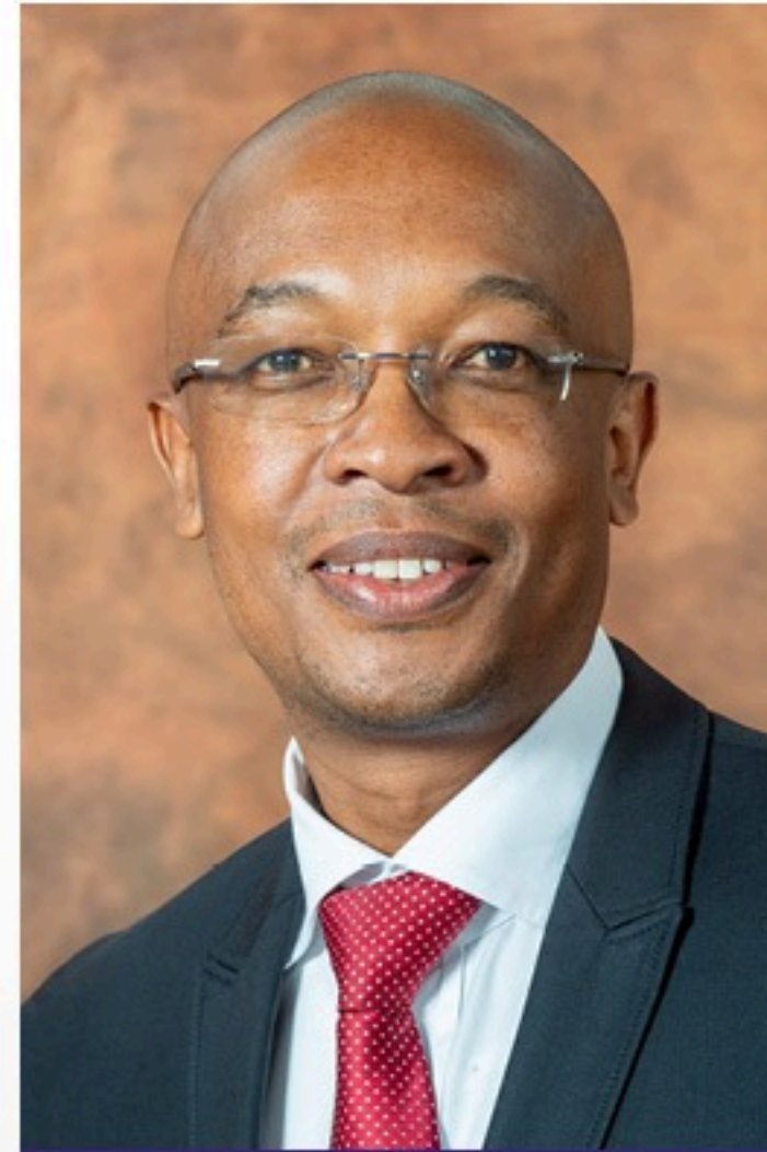
Parks Tau Deputy Minister of Cooperative Governance and Traditional Affairs

Following the classification and declaration of a number of occurrences as national disasters in terms of Section 23(3) of the Disaster Management Act, 2002 (Act 57 of 2002), the Minister of CoGTA has released details of the funds disbursed to Municipalities and Provinces for disaster interventions.