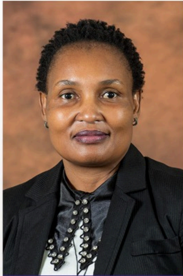
Thembi Nkadimeng Minister of Cooperative Governance and Traditional Affairs